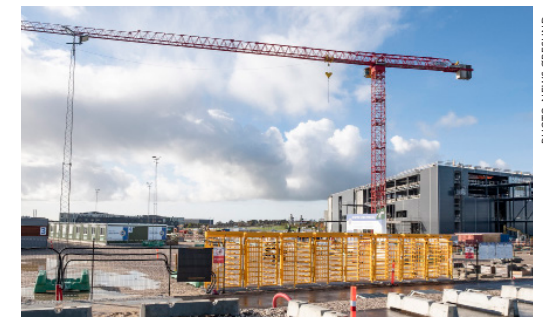
Fujifilm is expanding its plant in Hillerød for 17bn DKK.