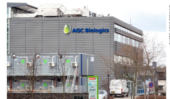
AGC Biologics is building a new plant in Søborg for 1.2bn DKK.