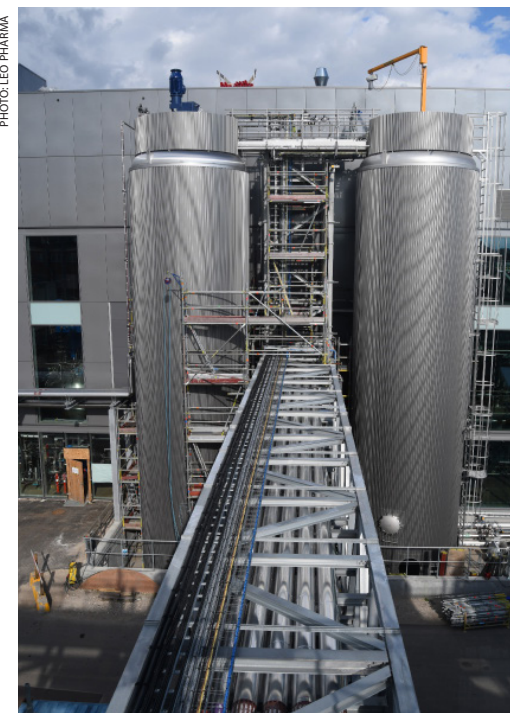
LEO Pharma is building a new plant in Ballerup for 1.5bn DKK.